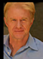
Ed Begley, Jr. Actor, Energy Advocate & Noted Author