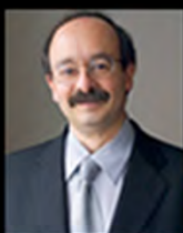
Amory Lovins Co-Founder, Chairman & Chief Scientist of Rocky Mountain Institute