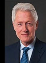
Bill Clinton, Founder, Clinton Foundation, 42nd President of the U.S.