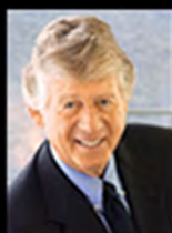
Ted Koppel Special Correspondent, Columnist & Anchor of ABC News' Nightline