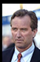
Robert F. Kennedy, Jr. Environmental Activist & Attorney