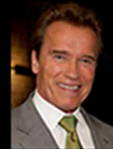
Arnold Schwarzenegger CA Former Governor, Cultural Icon & Environmental Crusader