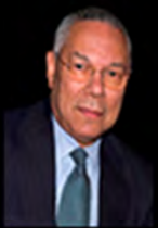
Gen. Colin L. Powell (USA Ret.)