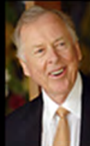
T. Boone Pickens Founder & Chairman of BP Capital Management & Author