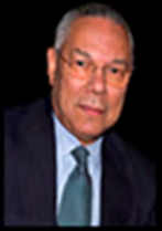
Gen. Colin L. Powell (USA Ret.)