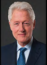
Bill Clinton, Founder, Clinton Foundation, 42nd President of the U.S.