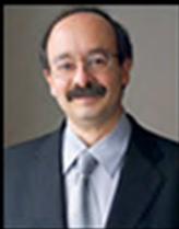
Amory Lovins Co-Founder, Chairman & Chief Scientist of Rocky Mountain Institute