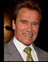
Arnold Schwarzenegger CA Former Governor, Cultural Icon & Environmental Crusader