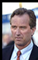
Robert F. Kennedy, Jr. Environmental Activist & Attorney