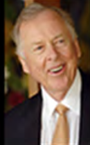
T. Boone Pickens Founder & Chairman of BP Capital Management & Author