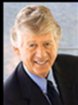
Ted Koppel Special Correspondent, Columnist & Anchor of ABC News' Nightline