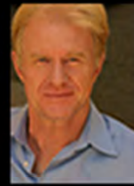
Ed Begley, Jr. Actor, Energy Advocate & Noted Author