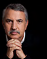
Thomas L. Friedman, Pulitzer Prize Winning Author & NY Times Columnist