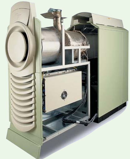
Side view of the Capstone Model C30 MicroTurbine