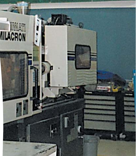
As an ISO-certified company, Harbec demanded—and received—the utmost quality from Capstone, an ISO-9001 company.

We're Proud to be ISO 9002 Certified We're Proud to be QS 9000 We're Proud to be ISO 14001