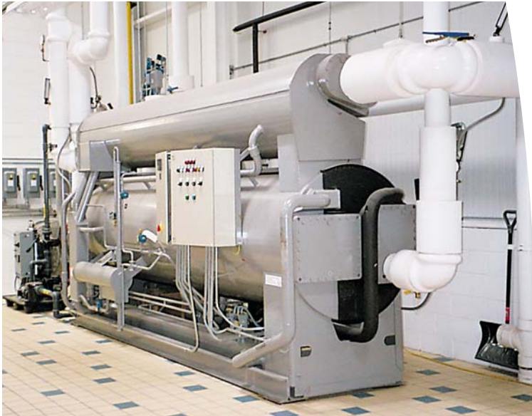
Hot exhaust from the Capstone MicroTurbines fires this Carrier absorption chiller to air condition the Harbec facility using near-zero electrical load.

The system must be the facility's primary source of power. Since even a momentary outage was as damaging as a lengthy one, standby generation alone was not an adequate solution. A battery UPS may have improved power reliability but would have increased the already high electric costs. The solution also needed to instantaneously load-follow the facility's needs, which often swing 30 percent several times a minute during full production phases. The onsite system must be a continuous source of quality power to the facility, with some level of redundancy. The odds of multiple primary and redundant units failing simultaneously are extremely low, but, if such a case were to arise, the utility grid would serve as the final backup source.