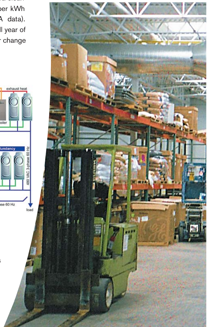
The "Green" Room: In keeping with the company's practices, Harbec's warehouse is designed for low environmental impact and high energy efficiency.

The built-in multipacking capabilities of Capstone MicroTurbines allow units to be taken down for maintenance while remaining units instantly and automatically pick up the displaced load. Up to 20 stand-alone units (unlimited number for grid-connected units) can be arrayed without the need for paralleling switchgear or other hardware beyond common computer cables. Up to 100 units can be multipacked via Capstone's affordable PowerServer™ option.