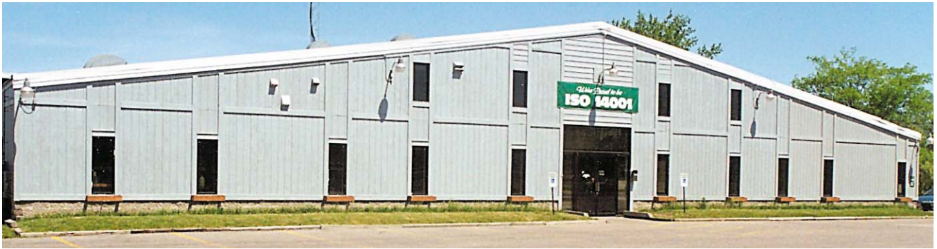
Like all other continuous process manufacturers, Harbec Plastics needs continuous power to protect production and prevent costly downtime.