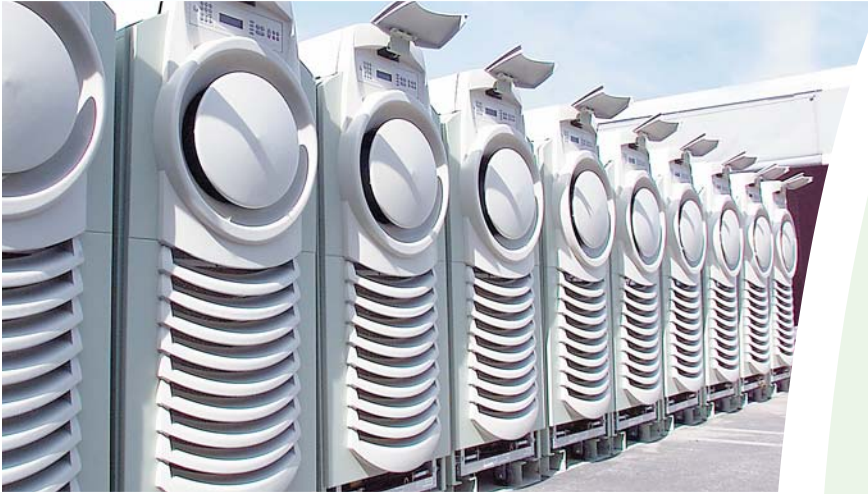
At Capstone's Los Angeles-area headquarters, microturbine arrays undergo extensive pre-shipment testing.

Harbec secured a natural gas contract with TXU that delivers fuel to the facility at an average cost of $6.85/MCF. At this rate, the value of the hot water recovered from the microturbines equates to over $0.03/kWh. Factoring in this recaptured heat value, electric power is generated for approximately $0.07/kWh, lower than the averaged local grid price of approximately $0.105/kWh. In the final analysis, total gas and electric utility bills are reduced 36 percent. At a capital cost of $1,100 per kW for the microturbine CHP hardware and Harbec's effective utilization rate of over 5,000 operational hours per year, this equates to a payback period of less than two and one-half years. At the time of this writing, natural gas is available in many parts of the nation for $4/MCF. At that rate, the utility bill savings would be over 50 percent and payback on the hardware investment closer to two years. These calculations do not include the positive added value of outage cost avoidance.