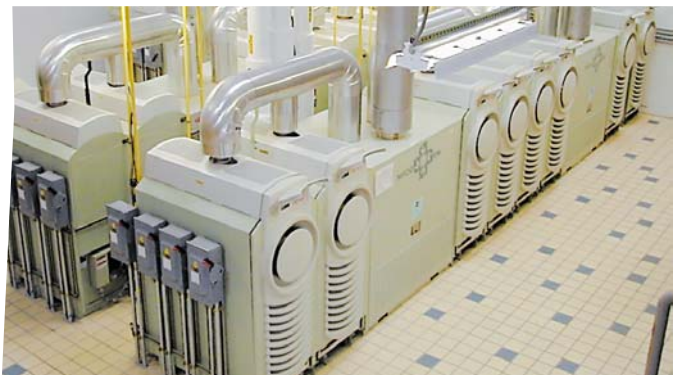
Overlooking the Capstone MicroTurbine installation at Harbec Plastics.